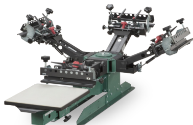
V2HD-14-T 1 Station/4 Color Tabletop Press