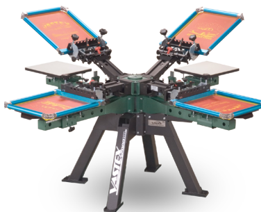
V2HD-44 4 Station/4 Color