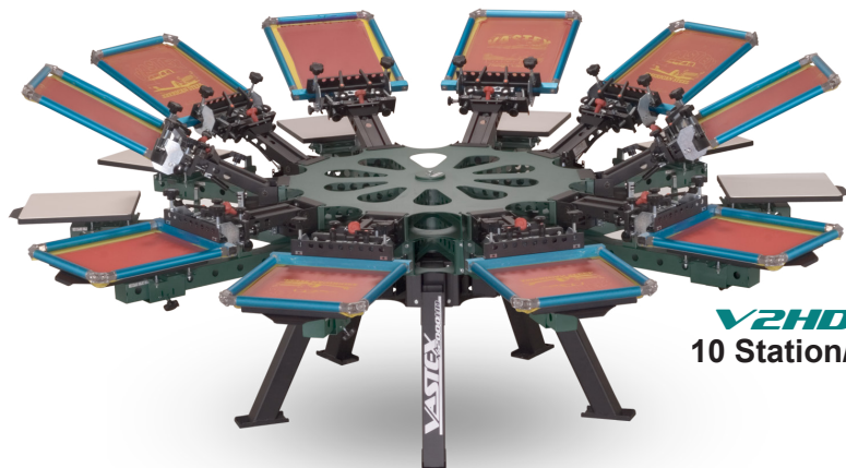
V2HD-1010 10 Station/10 Color