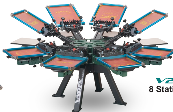
V2HD-88 8 Station/8 Color