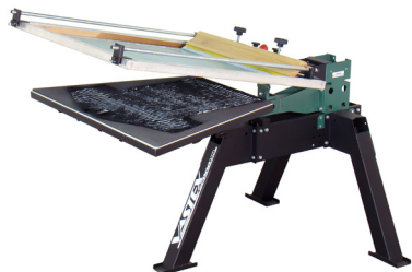
V2HD-FP-11 1 Station/1 Color Allover Press