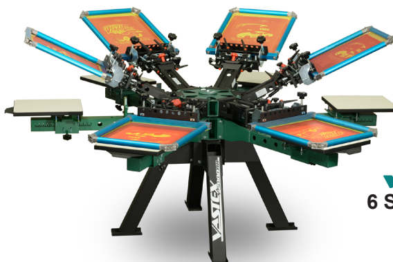
V2HD-66 6 Station/6 Color