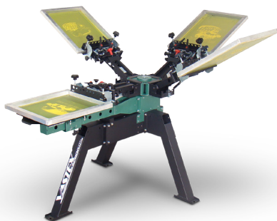
V2HD-FP-14 1 Station/ Color