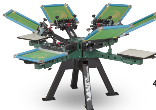
V2HD-46 4 Station/6 Color